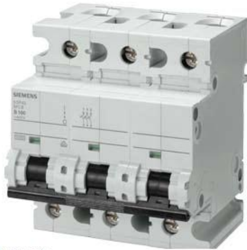
CIRCUIT BREAKER 400V 10KA, 3-POLE, D, 100A, D=70MM