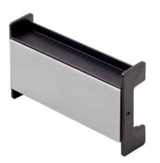
Self-adhesive tape mounting Intitial adhesive power is 40% and 1.1 lbs after 24hrs