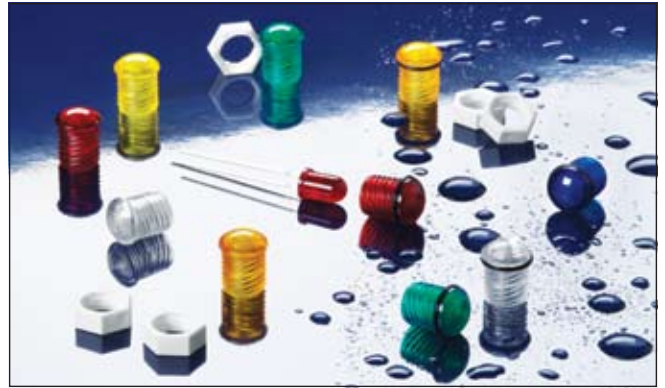
U.S. & Foreign Patents Issued and Pending