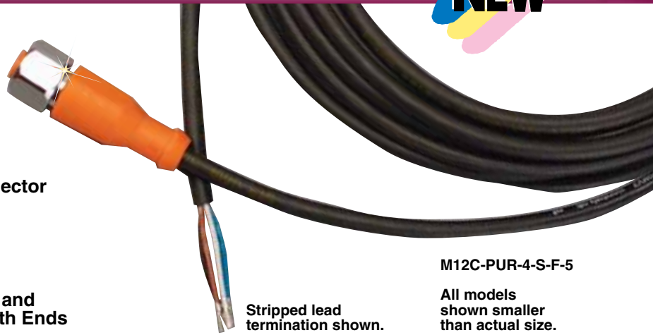
Stripped lead termination shown.