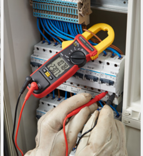
The ACD-14-PRO-EUR can test and display voltage and current measurements simultaneously with the large backlit LCD dual display, for voltage drop tests and other applications.

Voltage drop test - dual display allows user to view voltage and current simultaneously to assess voltage drop for current changing from zero to a maximum value.