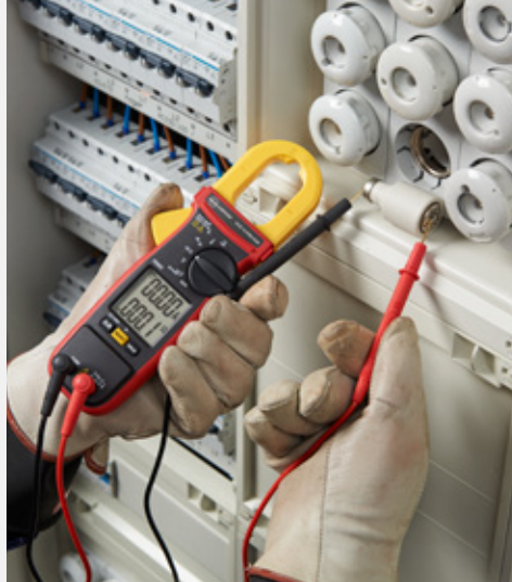
The ACD-14-PRO-EUR has a full set of functions to cover a variety of professional applications.