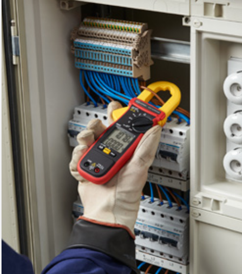
The Beha-Amprobe ACD-14-PRO-EUR features low profile jaws to test in tight spaces with TRMS for accurate measurements.