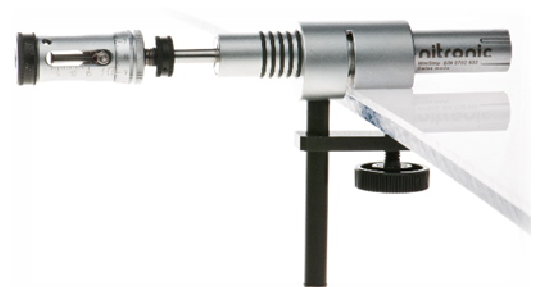
MiniStrip with bench clamp