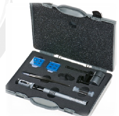
MiniStrip with Advanced Set