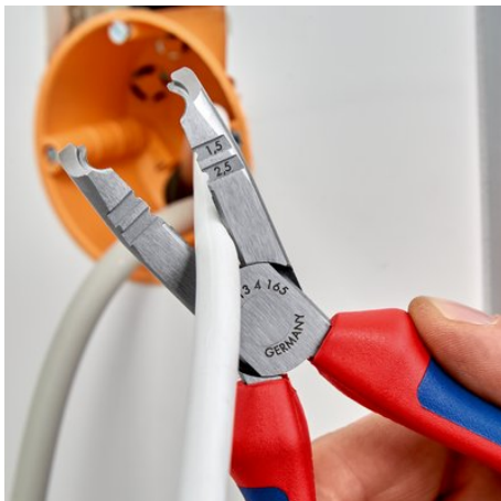
Cutting of cables of up to Ø 13 mm