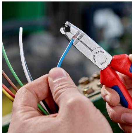
wire stripping holes for 1.5 and 2.5 mm 2 conductors