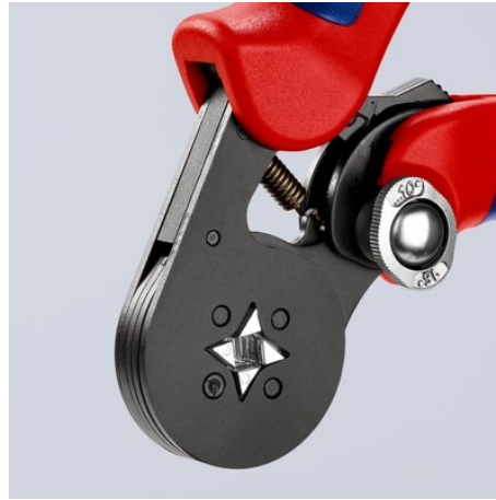
Crimping capacity can be switched over simply from 10 mm 2 to 16 mm 2 .