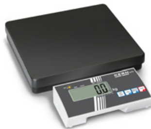
KERN MPB with free-standing display device