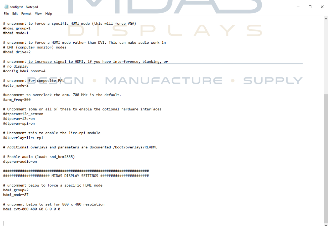
FIGURE 3 - EXAMPLE OF A CONFIG FILE