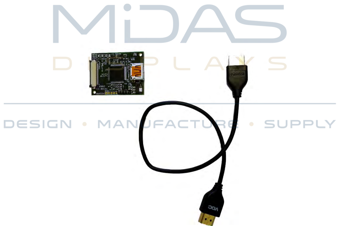
FIGURE 1 - MDIB-11 (LEFT) & HDMI CABLE (RIGHT)