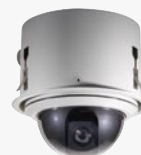
FCS-4300/4400/4500 Day/Night P/T/Z IP Speed Dome Camera