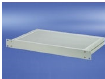
Photo shows 1 U