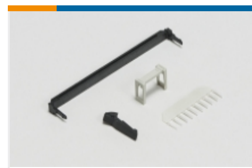
Ribbon Connector Accessories(1)