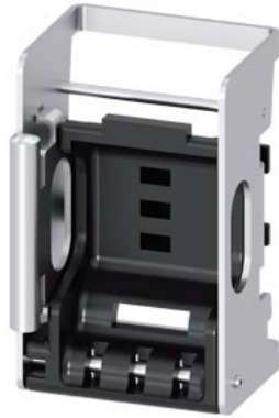
padlock device for handle accessory for: 3VA6 150/250/400/600 3VA5 250