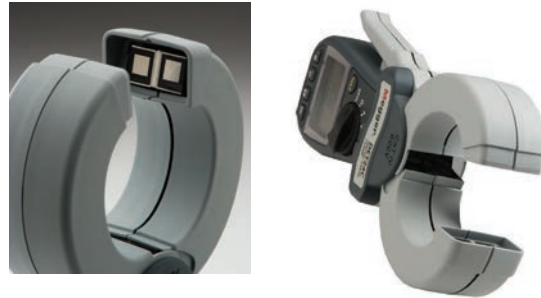
The clamp head of the DET14C/24C has a smooth mating surface and no interlocking teeth. Its large elliptical design improves access to the test specimen.