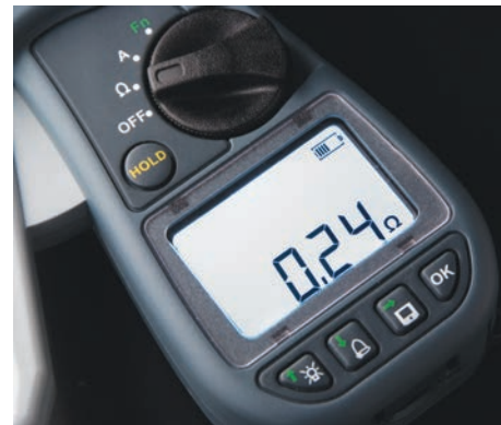
Close up of instrument's front panel.