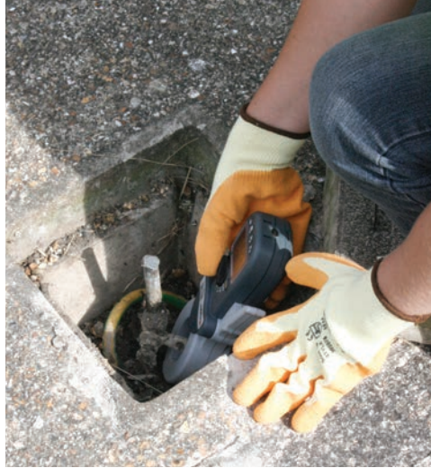
The DET14C is shown measuring a ground spike in a ground well.