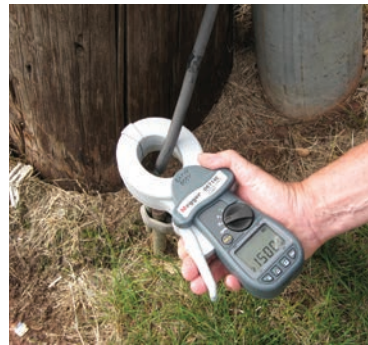
The DET14C is being used to test a pole ground.