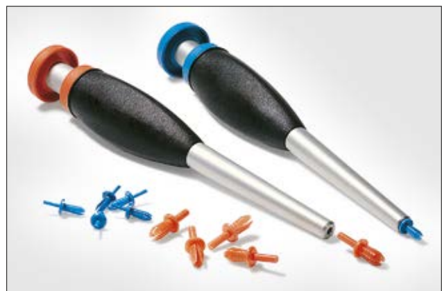
Rivet Tools HTWD-RT4, -RT6.