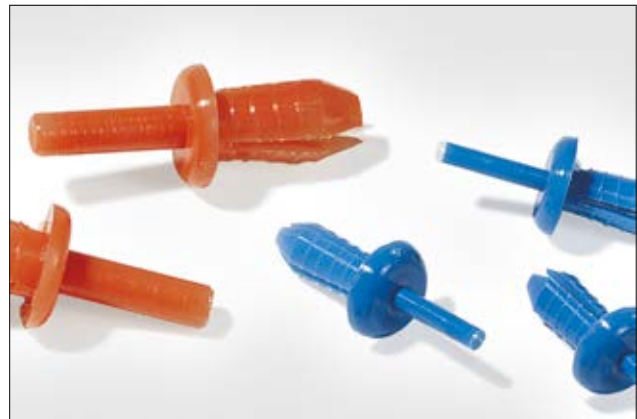
HTWD-R4 and HTWD-R6 Rivet.