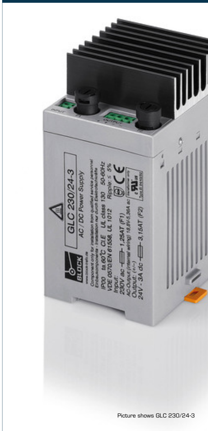
Picture shows GLC 230/24-3